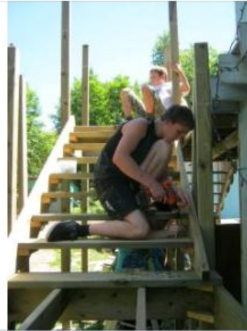
Say something about this photo...