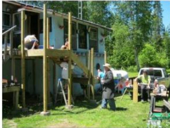
Say something about this photo...