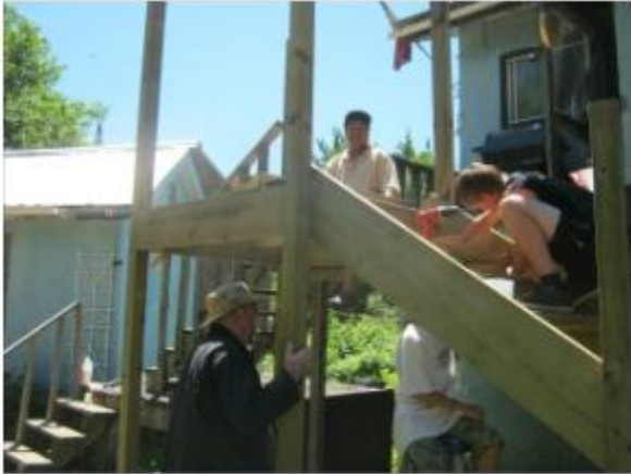
Say something about this photo...