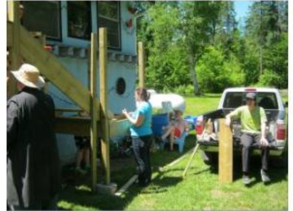
Say something about this photo...