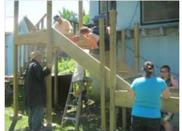
first set of stairs...