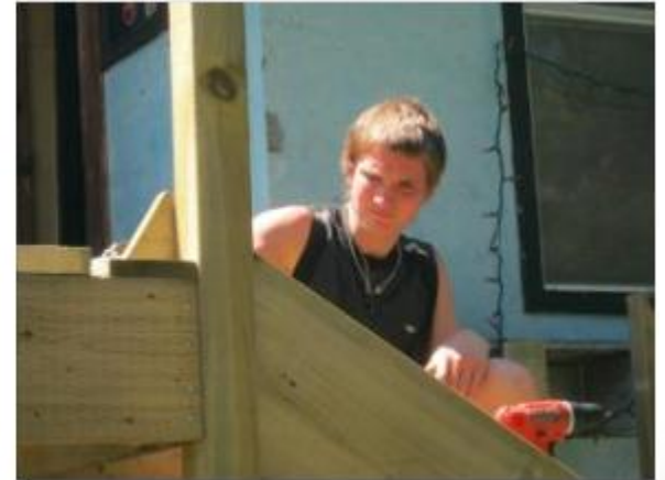
Say something about this photo...