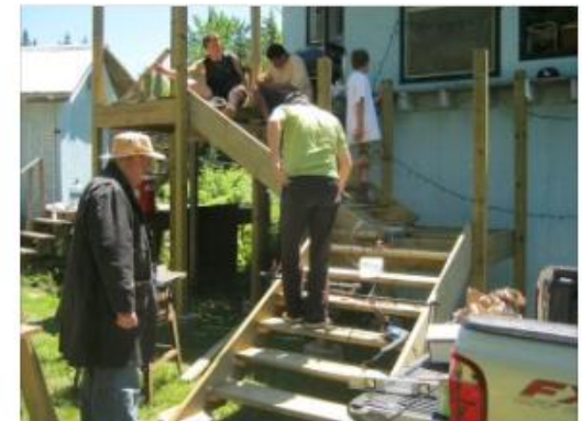
Say something about this photo...