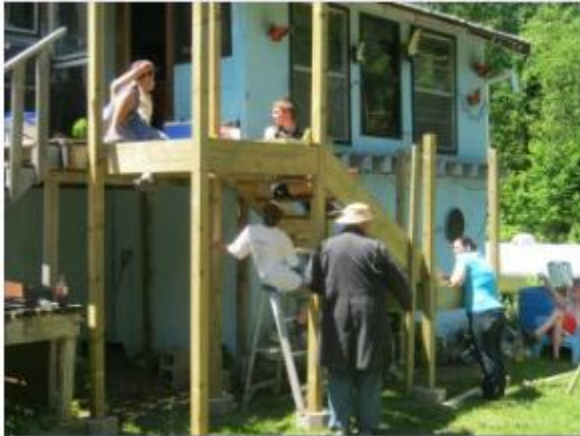
Say something about this photo...