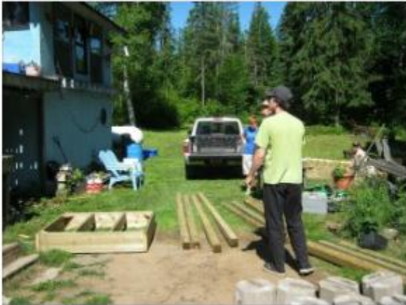
laying out the materials...